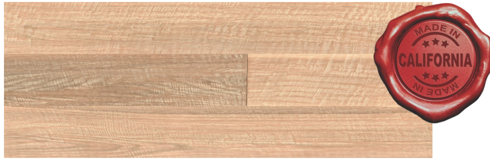
White Oak 11011 (Premium Grade shown)