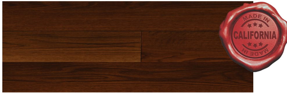
White Oak 11010 (Premium Grade shown)