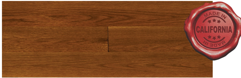
White Oak 11009 (Premium Grade shown)