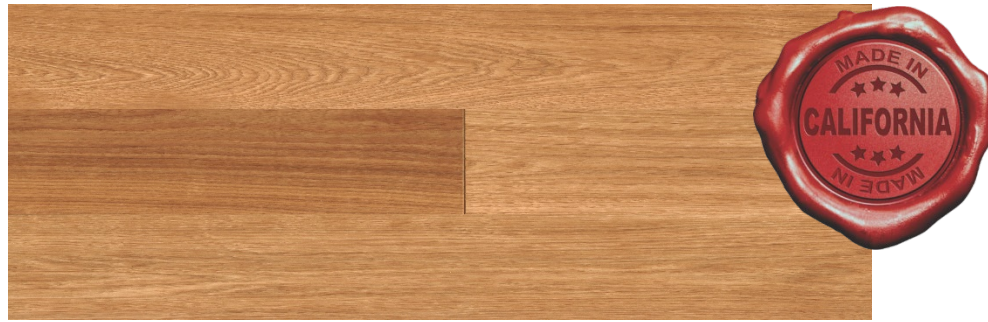
White Oak 11008 (Premium Grade shown)