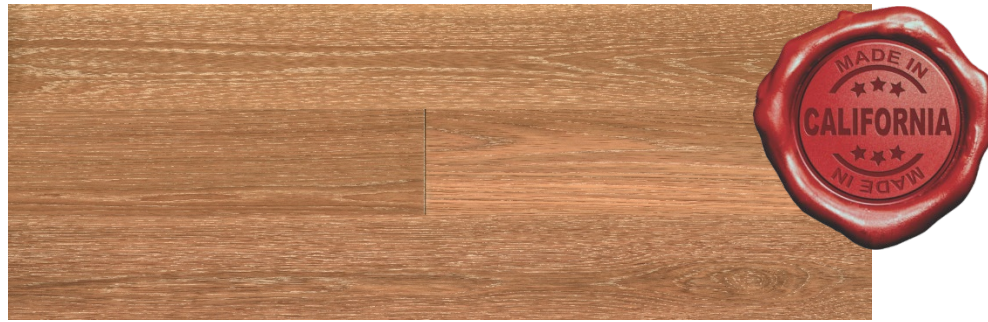
White Oak 11007 (Premium Grade shown)