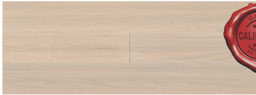
White Oak 11006 (Premium Grade shown)