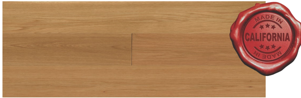
White Oak 11005 (Premium Grade shown)