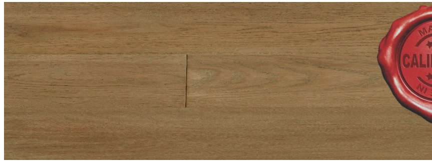
White Oak 11004 (Premium Grade shown)