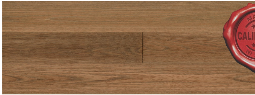
White Oak 11003 (Premium Grade shown)