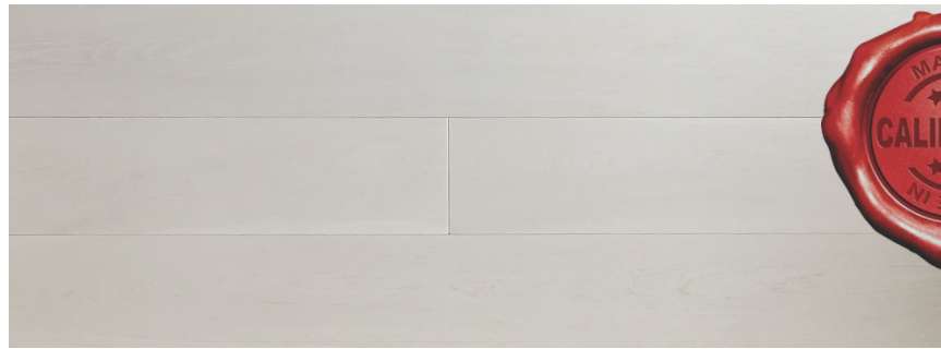
White Oak 11002 (Premium Grade shown)