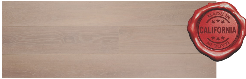
White Oak 11001 (Premium Grade shown)